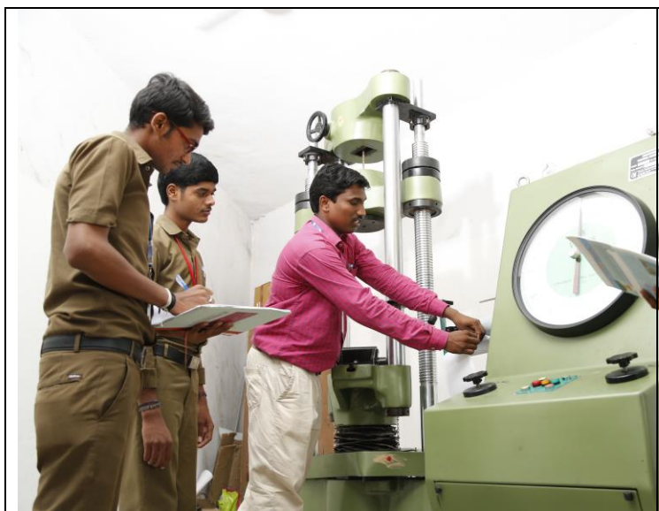
Mechanics of Solids Lab