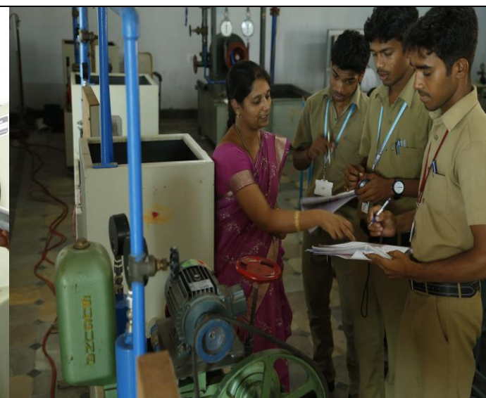
Fluid Mechanics & Hydraulic Machinery Lab